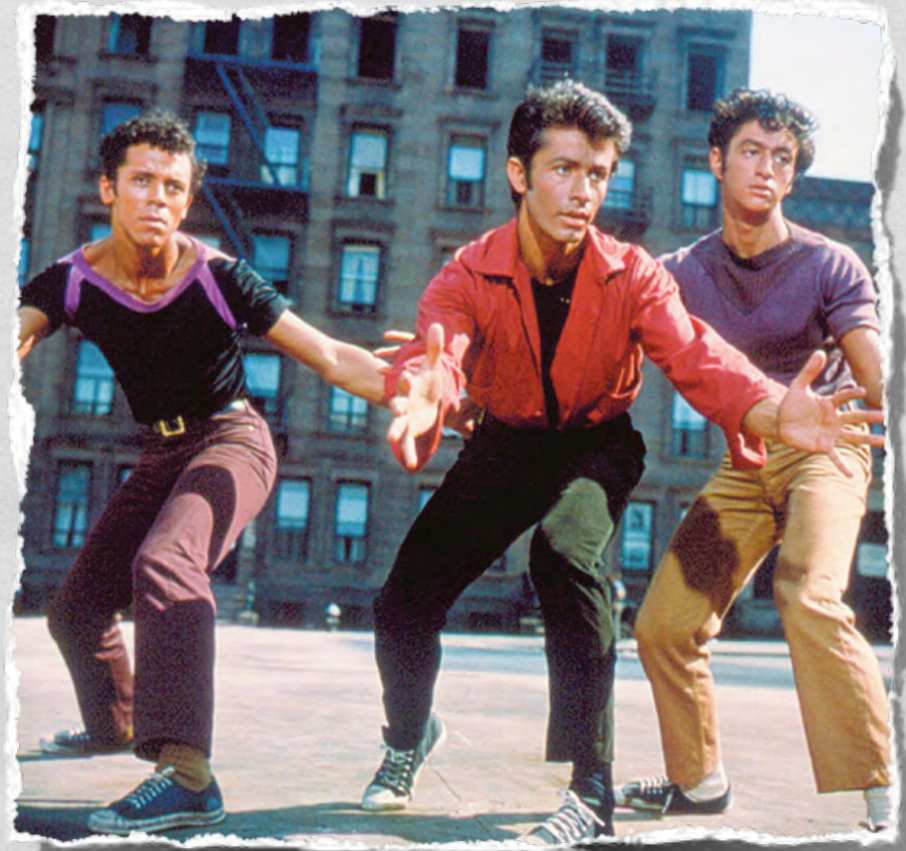
West Side Story (1957) Bernstein & Sondheim