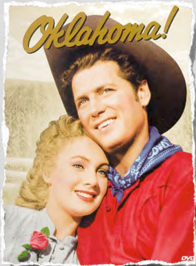
Oklahoma! Rodgers & Hammerstein (1943)